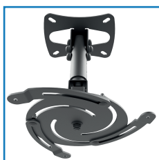
3 mounting holes